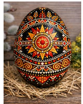
pysanka egg - created by Copilot 31/03/26

Easter eggs predate Christian times by a long way. Ancient Romans, Egyptians and Persians exchanged eggs as gifts during spring festivals. In Greece, red eggs, or kokkina avga, are an Easter tradition symbolising the blood of Christ and his resurrection. Ukraine has a tradition of pysanka eggs which are highly decorated using wax-resistant dyes.